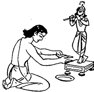
5. Pādasevana: Serving