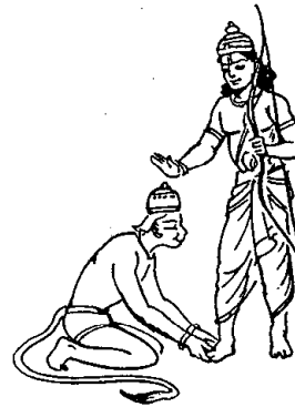
7. Dāsya: Servitude