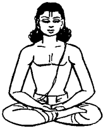
3. Smaraṇa: Remembering