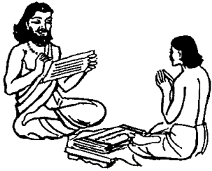
1. Śravaṇa: Listening