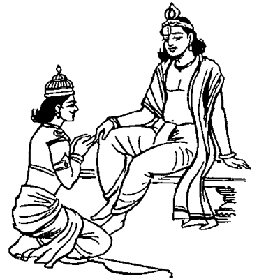
8. Sakhya: Companionship