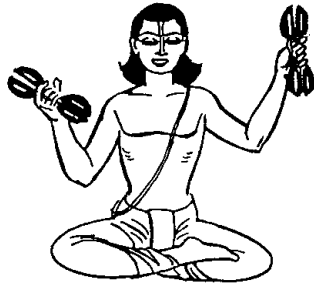
2. Kirtana: Singing