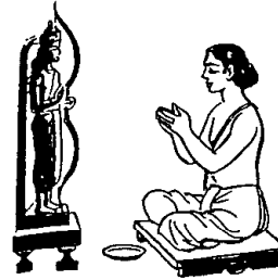
6. Vandana: Praising