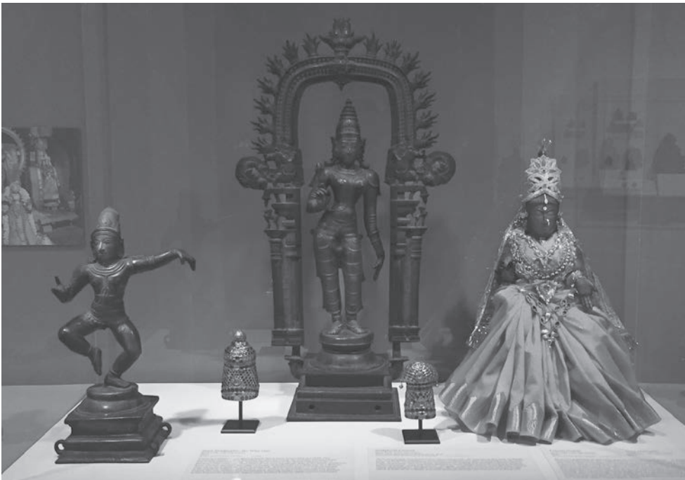
Figure 11: Display of South Indian bronzes at the Newark Museum of Art with a consecrated and fully adorned metal statue of Parvati to the far right. August 2016.

performed in South Asia. Unlike in a museum (or even a Christian church), touching is, in fact, the most natural devotional activity in the Indic context. 5 The divine is present in a living image for immediate, tactile access. Many images that we see today in a museum setting were most of ten living presences to the communities in South Asia, and rarely seen in this denuded form without ornaments and garments when they were ritually active (Figure 10). If the image has been empowered with the divine presence through consecration and proper ritual maintenance by priests, and it has a proven record of channeling the divine presence and blessings to devoted petitioners, its aesthetic appearance is, in a way, secondary to the purpose of the image.