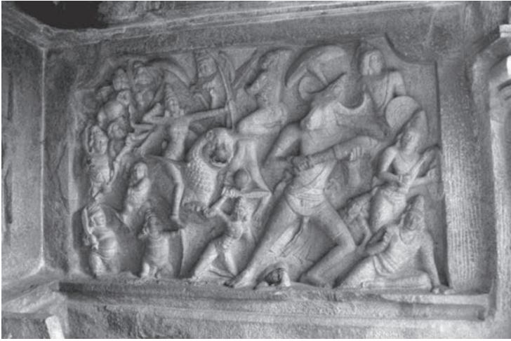
Figure 6: Durga battling the buffalo demon, Mahishamardini Cave. ca 670–700 CE (reign of Parameshvara, Pallava Dynasty), Mamallapuram. Granite, tableaux.