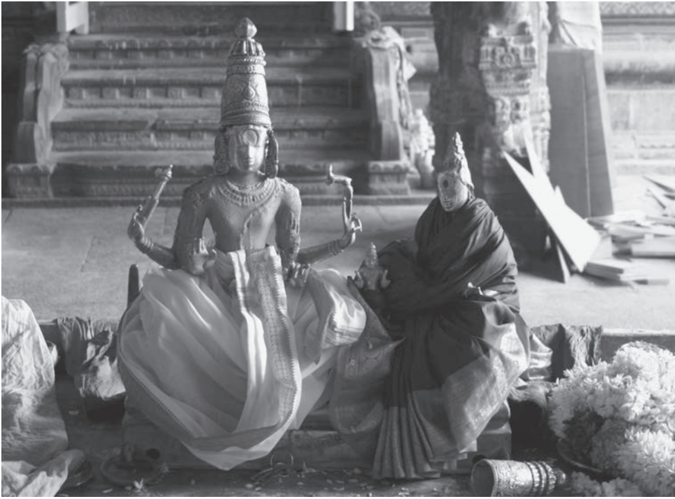
Figure 10: Somaskanda in worship ( ca. eleventh-century metal sculpture with recent adornments), Ekamranatha Shiva Temple, Kanchipuram, Tamil Nadu. March 2004.