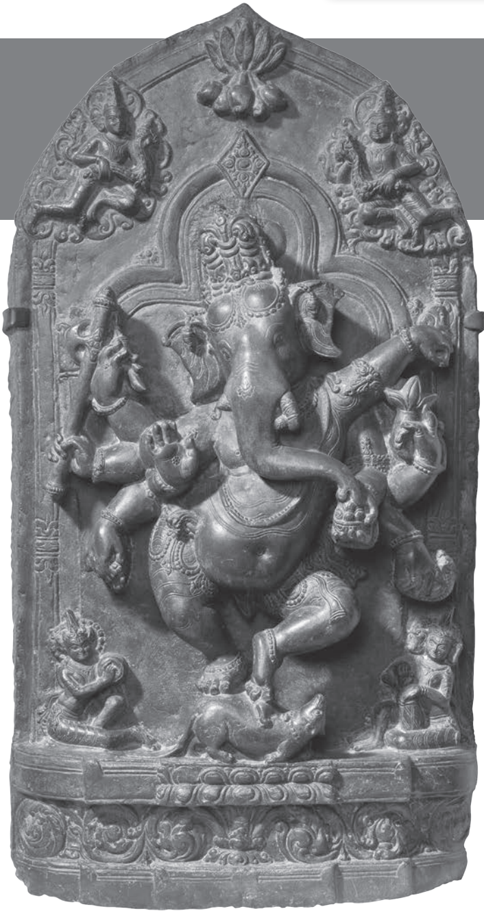
Figure 1: Dancing Ganesha, Lord of Obstacles. Eleventh to twelfth century, Bangladesh, Dinajpur District. Sculpture. Phyllite (65.41 x 33.66 x 12.7 cm).