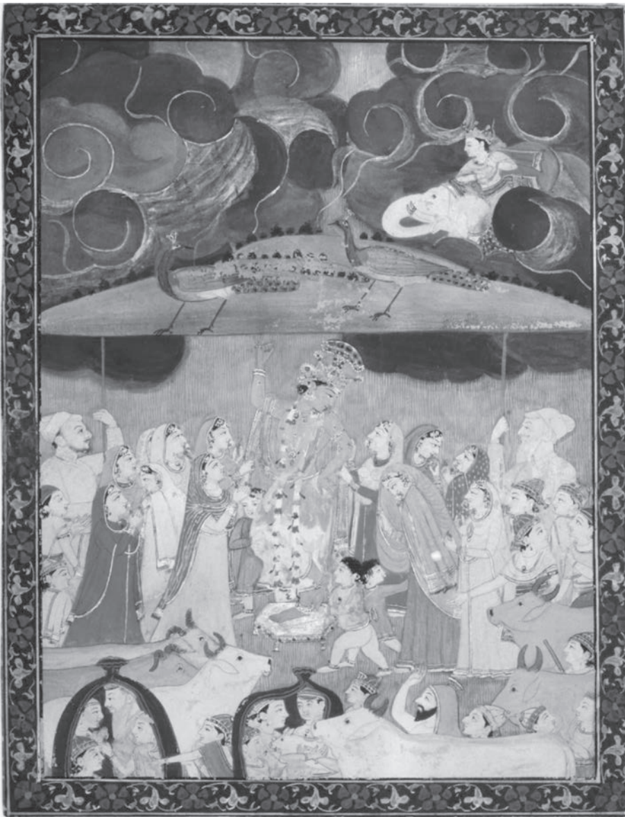
Figure 7: Krishna Raising Mt. Govardhan , c. 1825, Mandi, Himachal Pradesh, India. Pigments and gold on paper.