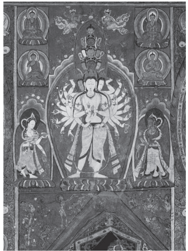
Figure 3: Avalokiteshvara, ca. late eleventh or twelfth century. Second floor of Sumtsek, Alchi, Ladakh, India. Mural.

Second, the multiple limbs (and heads) on a single body ingeniously capture multiple moments of interventions in one frame. Avalokiteshvara's ability to see all around and intervene whenever and