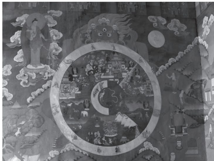
Figure 5: Wheel of existence (bhavacakra) at the entrance of Lamayuru monastery, Ladakh, India. June 2005.