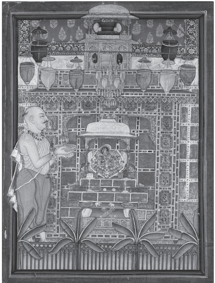
Figure 9: Maharao Kishor Singh II (1781–1828) of Kota Worshipping Krishna as Brij Rajji, c. 1825. Rajput Kingdom of Kota, Rajasthan. Gum tempera, tin, and gold on paper; overall: 24.5 x 18.8 cm.