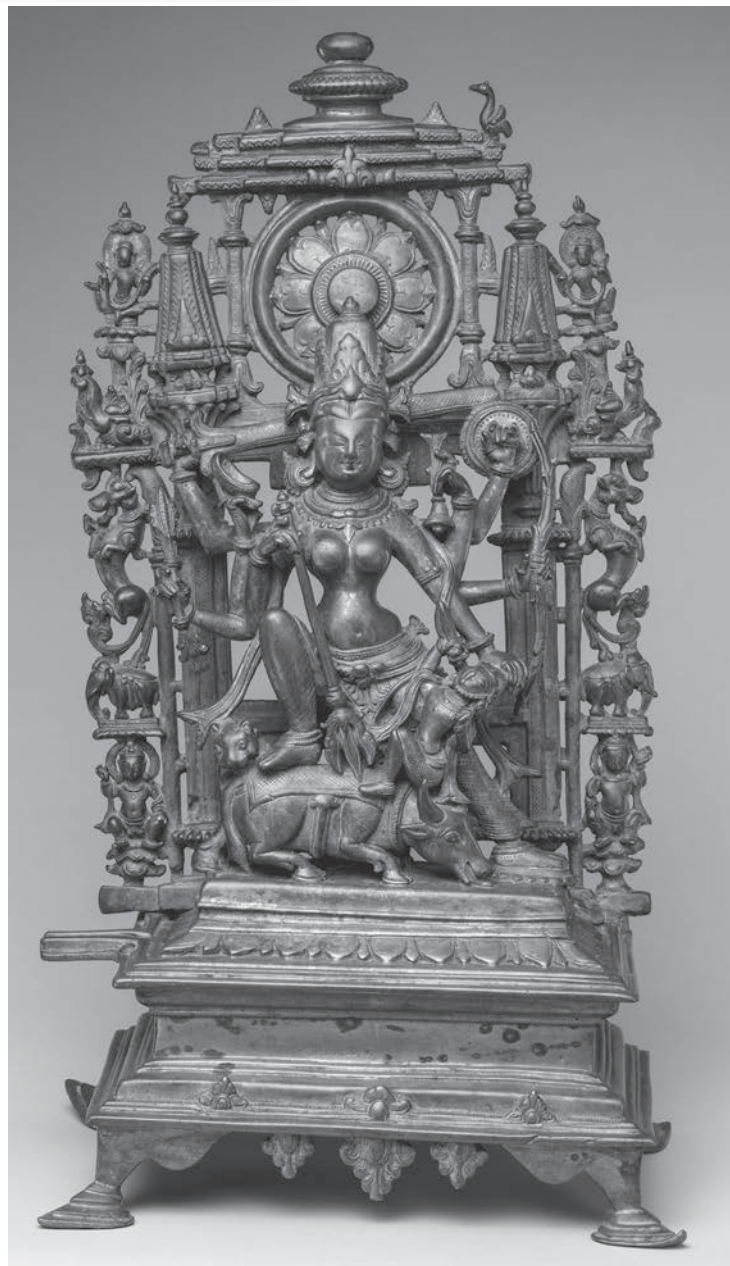
Figure 4: The Goddess Durga Slaying the Demon Buffalo Mahisha, twelfth century. Probably Chamba Valley, Himachal Pradesh. Brass (57.2 cm x 33 cm x 21.6 cm). Source: Metropolitan Museum of Art 2008.271.

As the world's first missionary religion, Buddhism spread from its land of origins in northeast India to all of South and Southeast Asia, then to China and East Asia. Monks and nuns were instructed by the Buddha to use vernacular dialects, matching the level of teaching with the capacity of the audience to follow. In this tradition, a wealth of art was created and designed to explain the Dharma, the Buddha's teaching. Most famous and well-employed would be the "Wheel of Life," which shows the six major rebirth venues for living beings in samsara , our world characterized by suffering, impermanence, and ignorance; according to one Buddhist monastic code, the Buddha instructs the monastics to place these paintings at the entrance of a monastery to educate visitors. It is still found at the entrance to most living Himalayan Buddhist monasteries like the Lamayuru monastery in Ladakh, India (Figure 5).