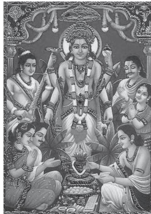
Figure 12: Vishnu Satya Narayan Vrata, lithograph.