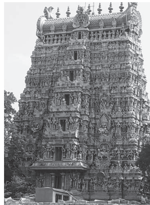
The Meenakshi Teemple, Madurai, Tamil Nadu.

South Asian religious images, especially those in Buddhist meditation halls or ashrams (Hindu monasteries), are made to convey the central spiritual ideals of the faith. The body of a Buddha, for example, should convey physical strength, mental serenity, detachment, and discernment; the ancient tradition specifies thirty-two characteristic bodily features that each have a meaning. Most generally, Buddha images should be beautiful, conveying calm, discernment, detachment, and mastery of this