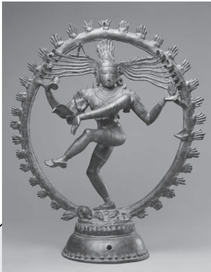
Shiva as Lord of Dance (Nataraja), Chola period, ca. eleventh century, Tamil Nadu, copper alloy (68.3 cm x 56.5 cm).